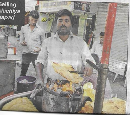
Selling khichiya papad